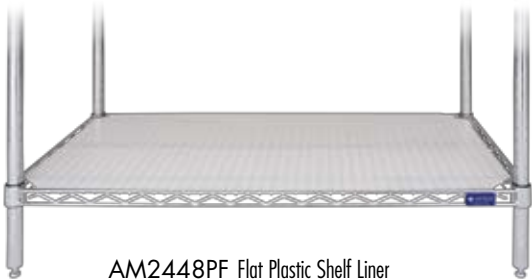
AM2448PF Flat Plastic Shelf Liner