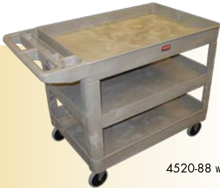
4520-88 with 4598 shelf